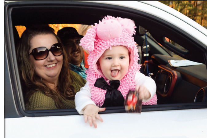
This cute piggie took advantage of the Halloween Trunk-or-Treat at Macedonia Baptist Church Saturday night.

The Lake Chatuge Chamber of Commerce hosted a drive-thru event on Halloween Day in conjunction with 22 local businesses to hand out over 5,000 pieces of candy they