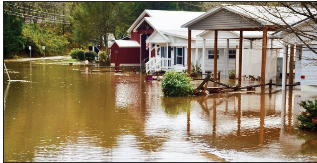
Tropical Storm Zeta caused the Hiwassee River to flow out of its banks Thursday morning, flooding low-lying areas like the Enchanted Valley RV Park.